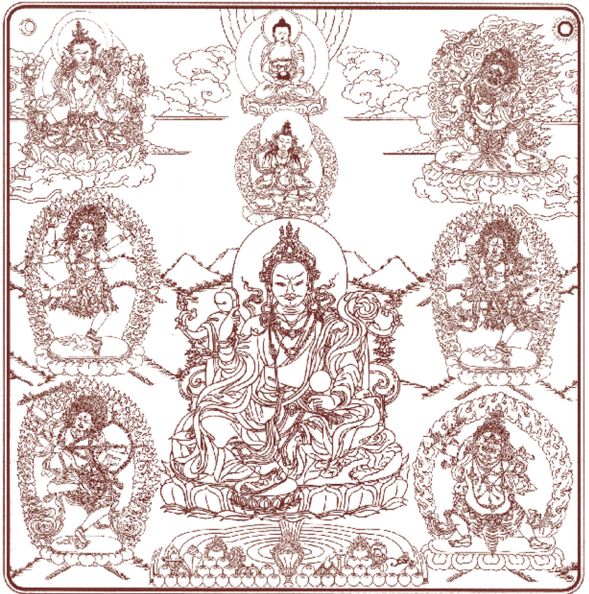
For specific identification of these deities, see our website.

Some of our revisions may go unnoticed by most people. For example, in the “Invocation for Raising Windhorse” we plan to hyphenate the Kalachakra mantra: OM HA-KSHA-MA-LA-VA-RAYAM. We hope that this will encourage people to pronounce this as if it were two words, OM and HAKSHAMALAVARAYAM, rather than sounding each of the syllables separately, as many do. These very special seed syllables are often written as a monogram, known as the “all-powerful ten,” and they are meant to be read as a unit, the ten components being H-K-SH-M-L-V-R-Y-M and the A vowel, added to each syllable. ♦