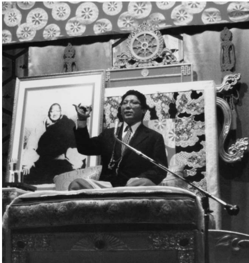
Vidyadhara the Venerable Chogyam Trungpa Rinpoche teaching "Awareness Is the Body of Meditation" at a Vajra Assembly in Boulder, March 1979.